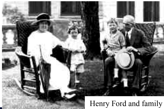
Henry Ford and family